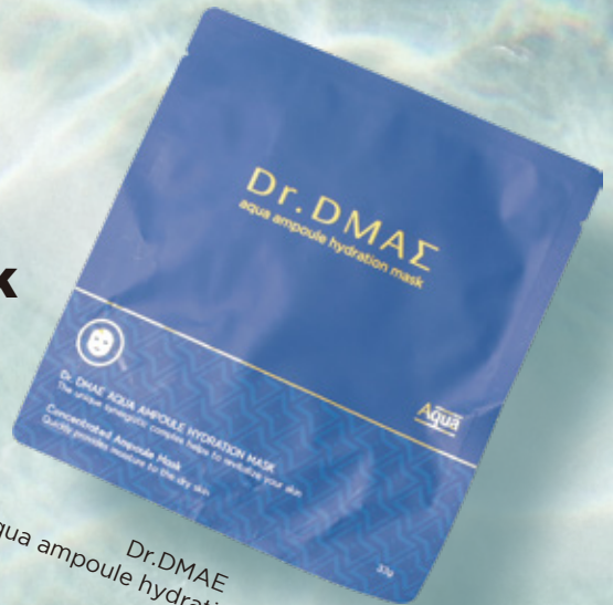
Dr.DMAE aqua ampoule hydration mask, 33g